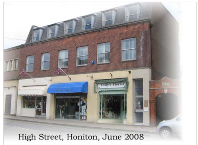
High Street, Honiton, June 2008

(b) The bottom level of any first floor window in the wall on which the advertisement is displayed.