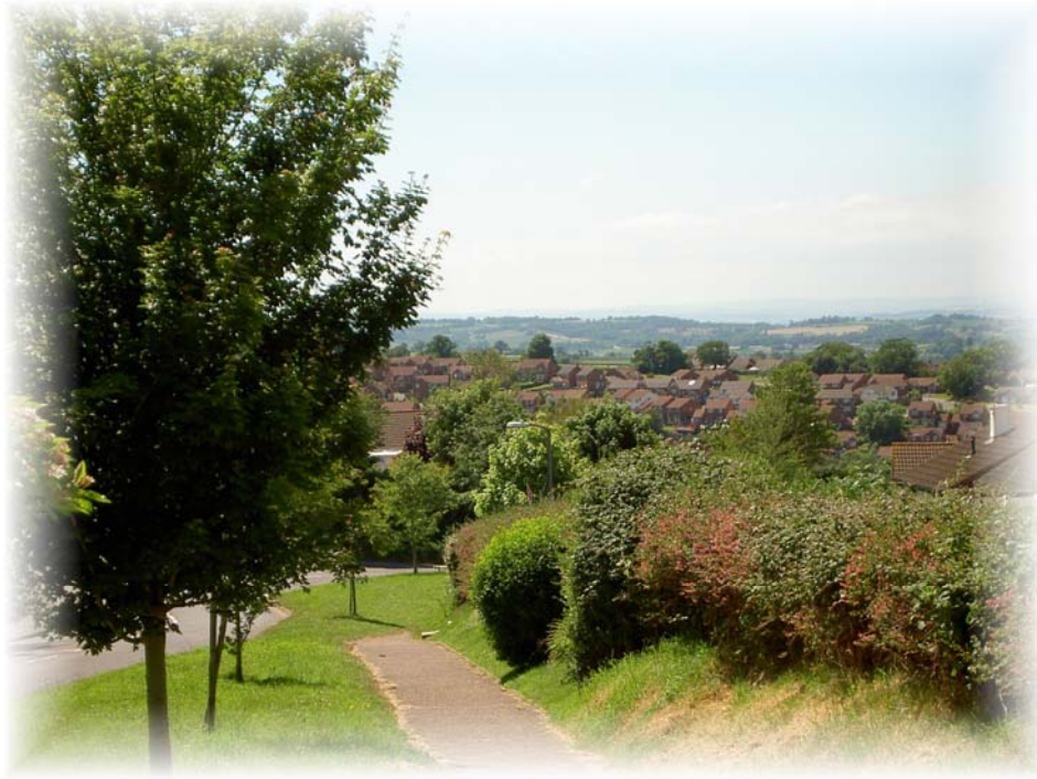
View Down Kings Road—from Tollgates