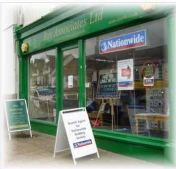
High Street, Honiton