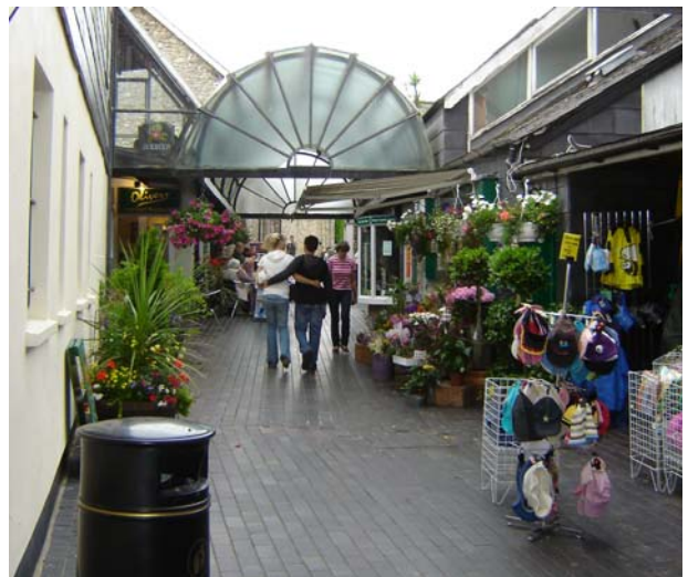
Black Lion Court