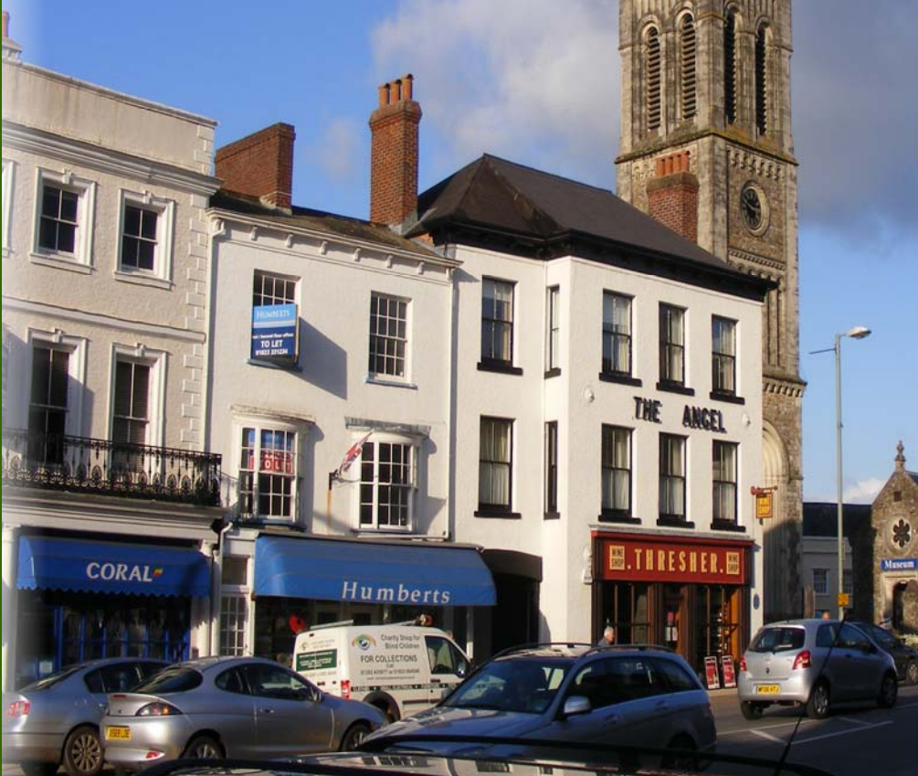
High Street, Honiton

This document has been prepared as a guidance by Honiton Town Council as a reference for use by them acting on behalf of East Devon District Council when dealing with Advertisement Consent applications.