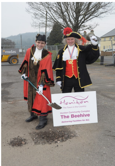
The first turf being cut