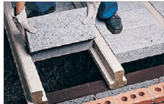
Block and Beam Flooring example