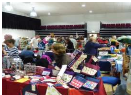
Recent Craft Fair