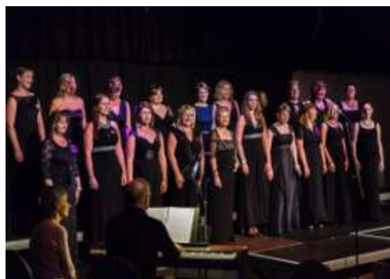
Plymouth Military Wives Choir

The Beehive, opened in April this year. The building is operated by a company set up by Honiton Town Council and is currently run by volunteers. Since the opening many and varied events have taken place in the centre. A rock oratorio "Christ Crucified", The Plymouth Military Wives Choir and international violinist Tasmin Little all played to capacity audiences. Children's puppet shows, youth theatre, comedy, one-man shows and music of all kinds have all brought visitors from far and wide. In addition The Beehive has hosted it's first fashion show and first craft fair. But the chief use of the centre has been by community groups. Six different dance groups use the building every week, a new community choir has started up, the café-bar hosts a monthly quiz and an acoustic night, tea dances have begun and Honiton Community Cinema show their monthly film. All in all, since April, about 60 different community organisations have booked The Beehive with 20 doing so on a weekly or monthly basis. Looking ahead, the purchase of cinema equipment will complete the last major aspect of fitting out giving the prospect of more films and live streaming of national shows with The Beehive becoming fully established as a thriving hub of activities and events for the town and whole area.