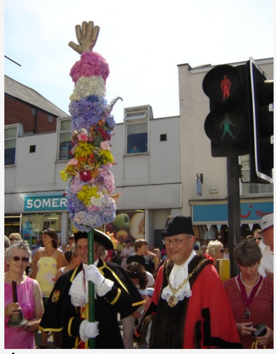
2006 - traffic lights too!!