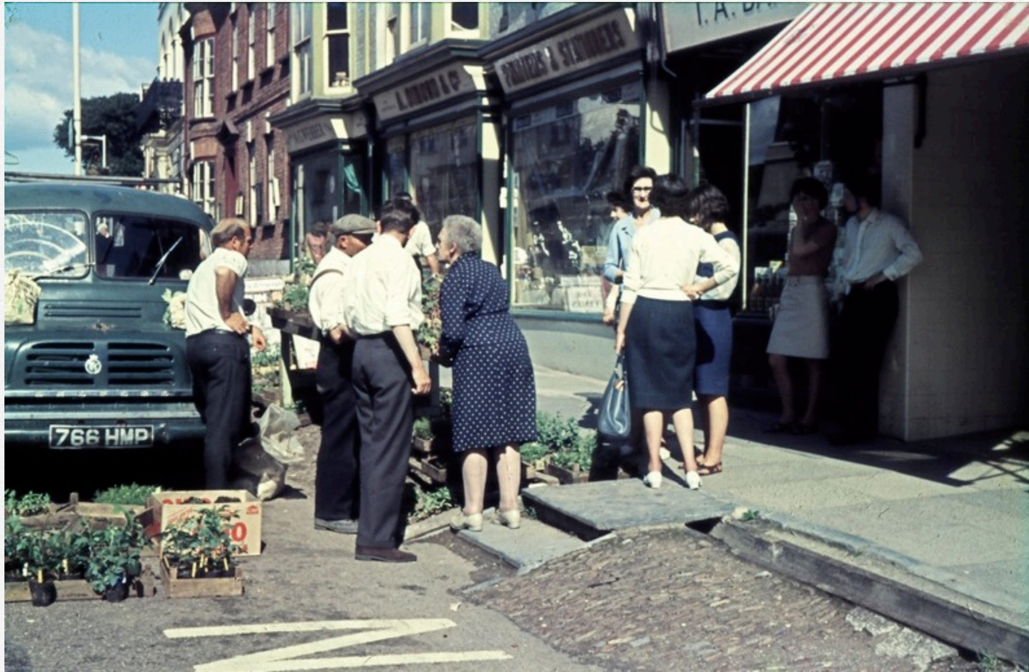
Before the event work went on