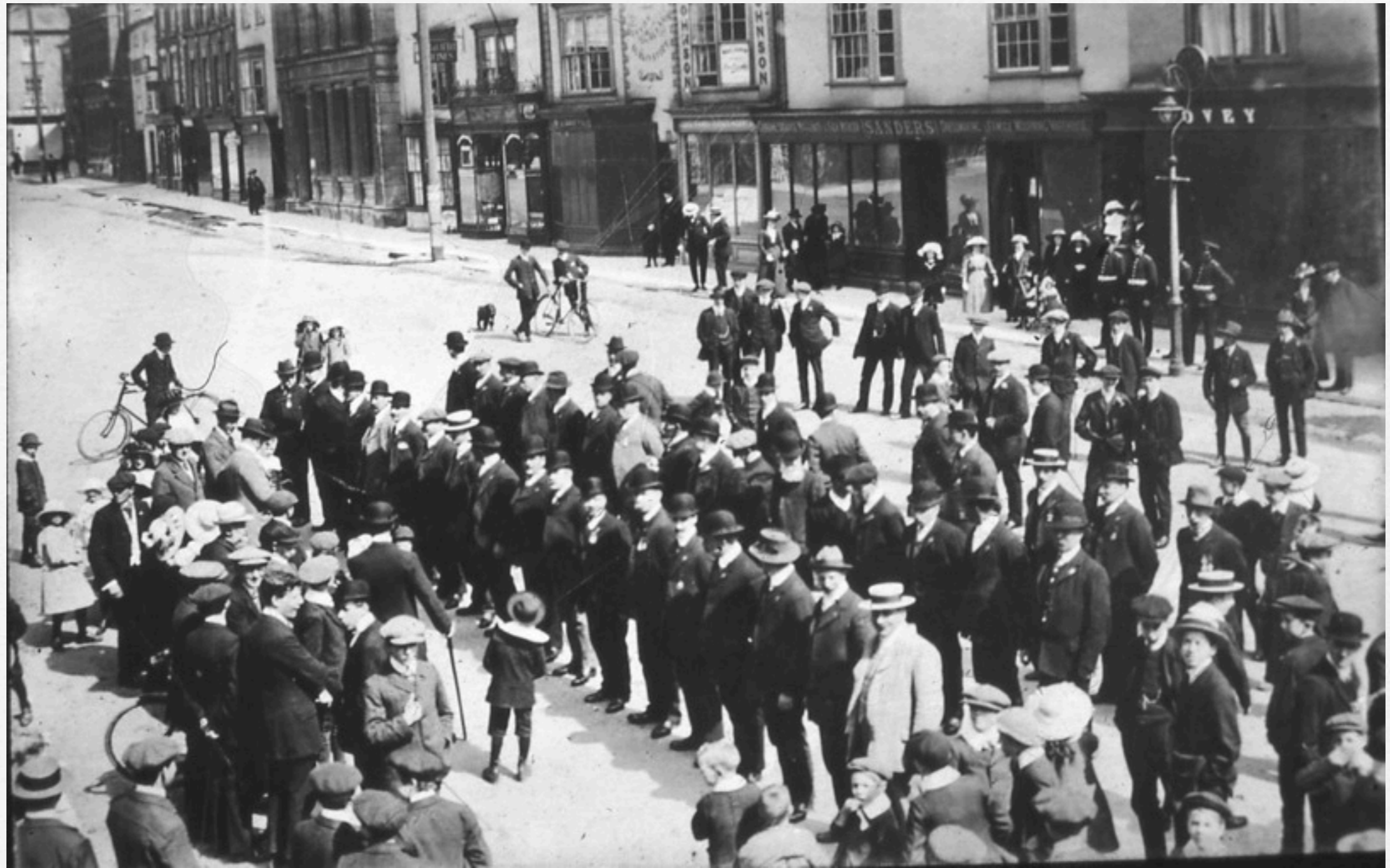
Possibly a remembrance service or other solemn affair